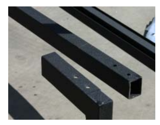
Using Provided 5/16" Bolts, bolt together supports as laid out.