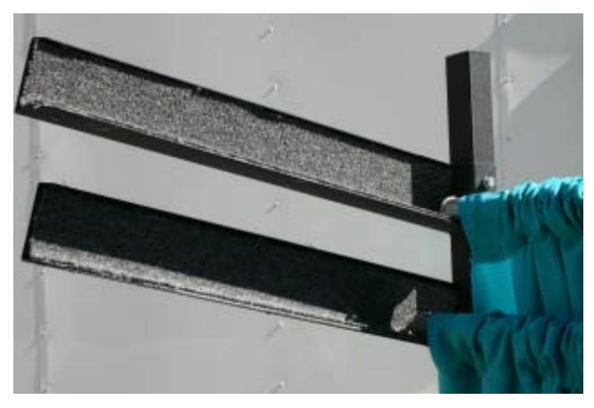
Load uprights in rear pocket, horizontally.

Load Drape Supports, by alternating levels as you load